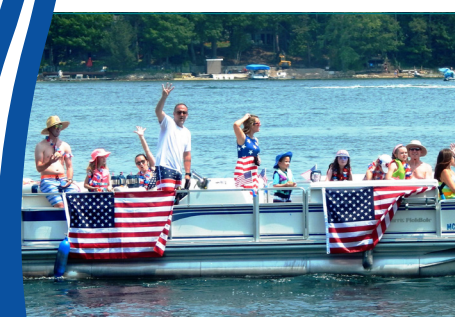
Patriotic, Harris Flotebote MC7270SD