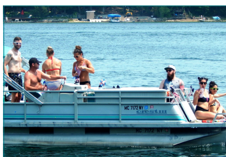
Patriotic, Crest III, MC7172NY