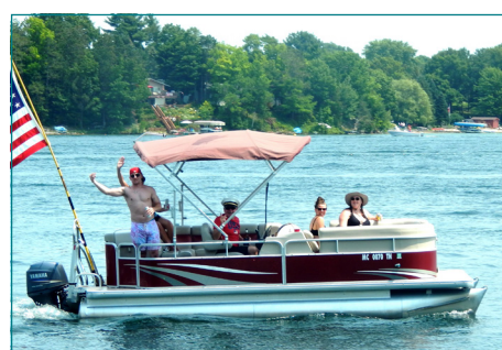
Patriotic w/Flag MC0070TN