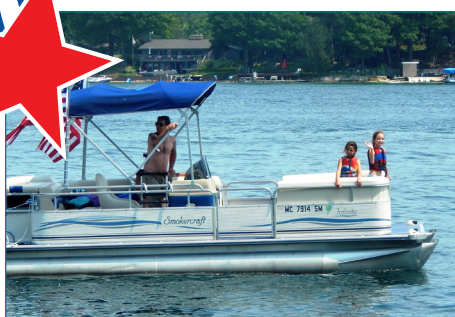
Patriotic, Smokercraft Infinity MC7914SM