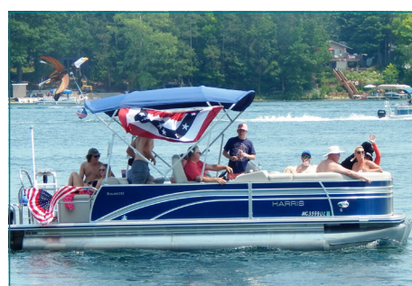
Patriotic, Harris Sunliner, MC3599UL