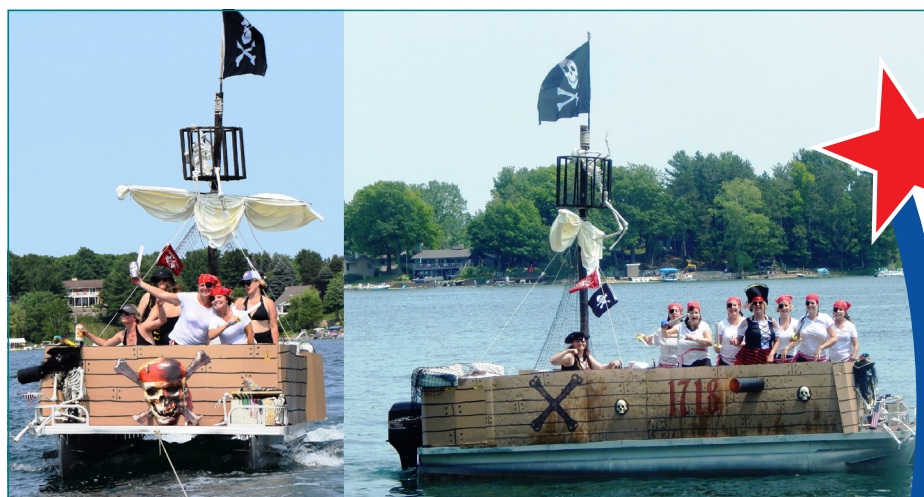
2nd Place – “Silver Lake Pirate Girls” Vance, Cesario, Cerny Families