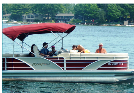
Patriotic, Aqua Patio, MC2069TP