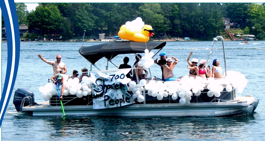
3rd Place – “Shower The People” Zolinski Family & Friends