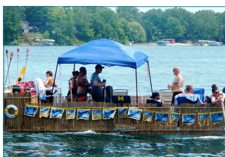
Patriotic, Corona Party