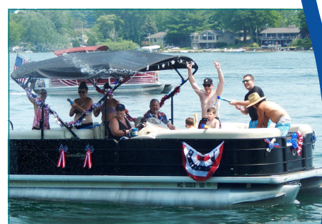
Patriotic, Sweetwater, MC200300