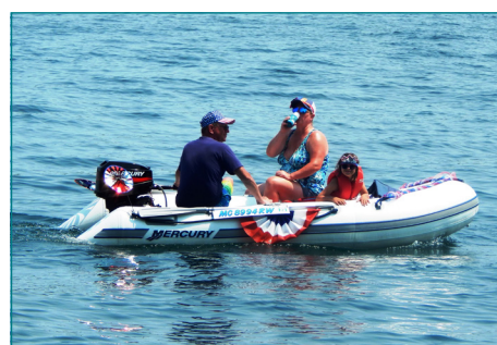
Patriotic, Mercury, MC8994RW