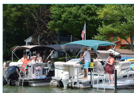
Grin Family & Friends, Judges