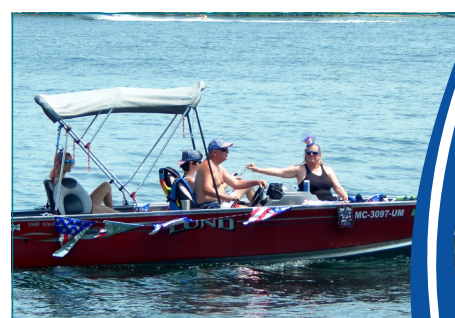
Patriotic, Lund, 1800 Alaska MC3097A