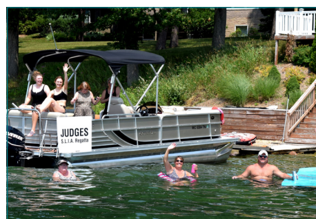
Ford Family & Friends, Judges