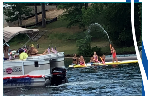
... Sorry You Missed.....