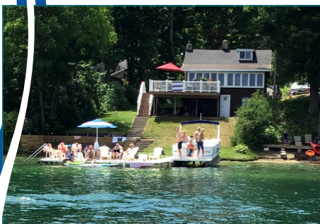
The Whole Gang's Here!