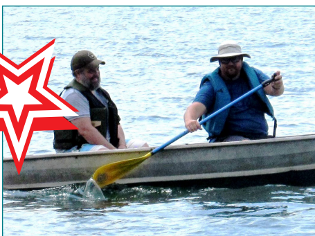
Towing Party Last Boat