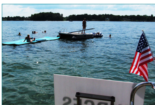
... We're Ready for the Show ...