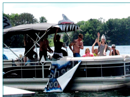
Shark Bait – Zolinski-Guitar Families