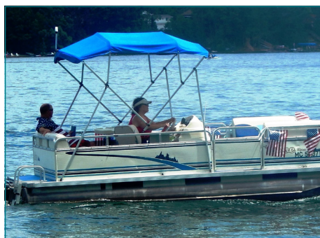
MC5_37RN – Couple On A Cruise