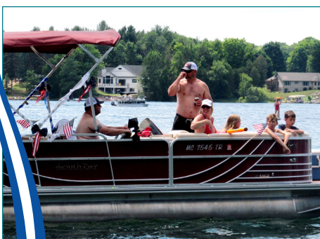
MC7545TR – It's A Family Affair