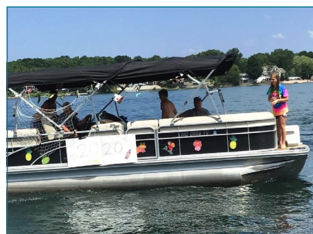
It's 2020 – MC0908TV Family