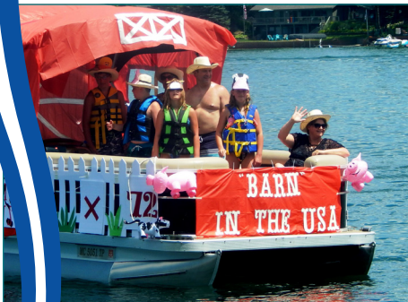
#72 Barn In USA

Due to the Covid Pandemic, we were forced to do things differently this year, requesting you to go online to get your registration form for your boat entry with theme, family name and contact information and send to us. Many of you did – but others perhaps decided at the last minute to enter or didn't have the means to go online and sign up – so we have great pics of many of you without identity. ... Therefore we have identified you with our interpretation of your theme and by your MC number. . . THANK YOU SO MUCH for joining us, theme or not – it was one of our best years yet! Please enjoy seeing your pics – you know who you are!