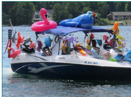
Under The Sea - Robertson Family