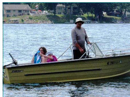
Towing Party Lead Boat