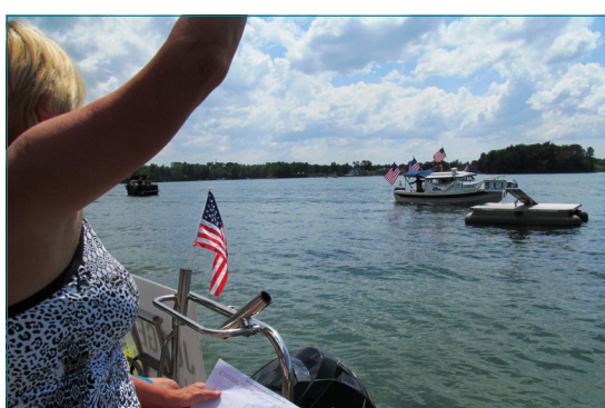
... With Scoresheet in Hand ...