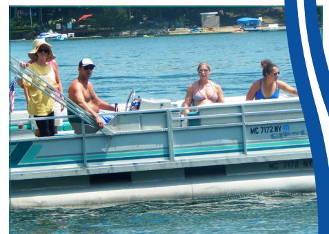
MC7172NY – Getting Some Sun