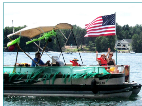
MC7506MD – Love Grass Skirts