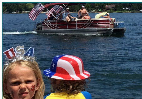
What Do You Think Dad