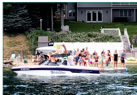
Lovin' Your Malibu