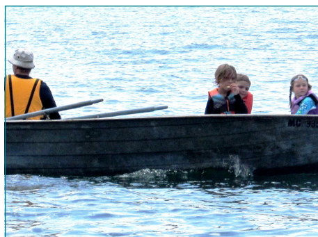
Towing Party Middle Boat