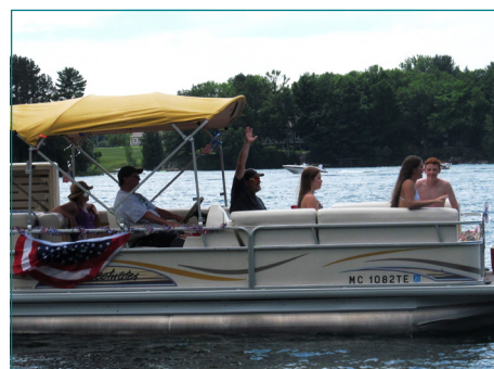
MC1082TE – Family Enjoying the Ride