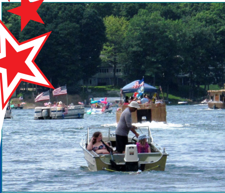
It's SLIA On Parade!