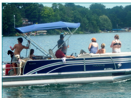
MC3599UL – Dogs On Board