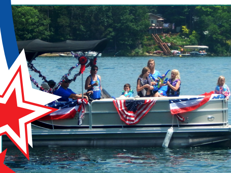
MC5432TN – Family Celebration