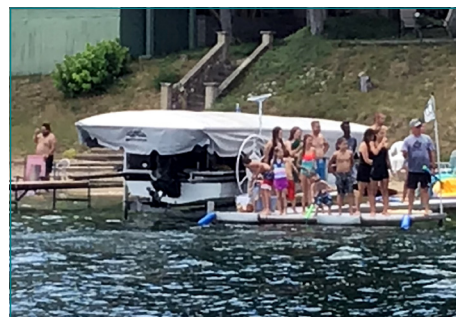
Ready & Waiting