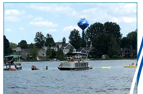
Coming Out to Meet You