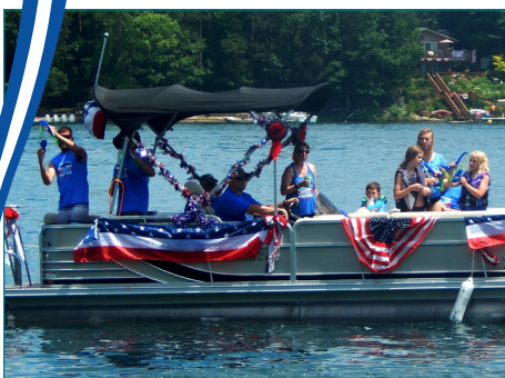
MC5432TN – Family Celebration