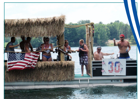
TikiTunes – Alpers Family