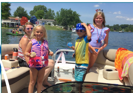
We're Ready for the Show