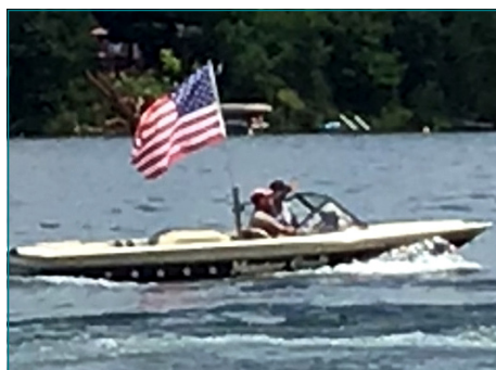
Mastercraft Joining In