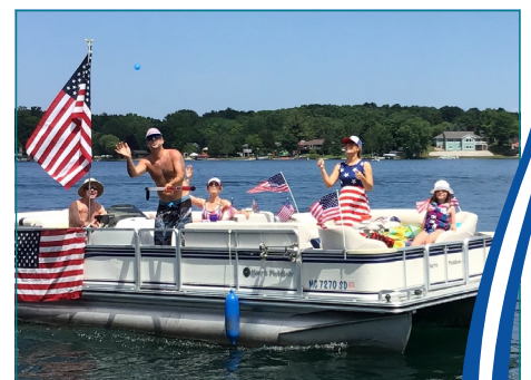
MC7270SD – Stars & Stripes