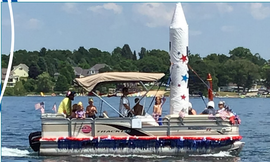
3rd Place – Berden Family & Friends Silver Lake Rocket