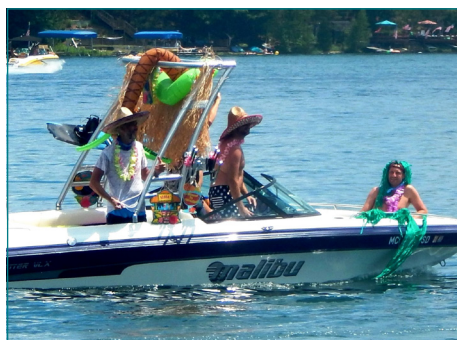
Malibu Luau Party