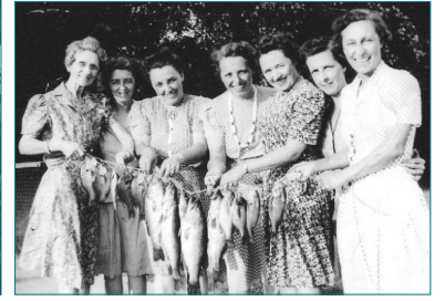
(Pictures taken of guests at the Silver Lake Inn, Circa 1930-40's, Get those white shoes!)