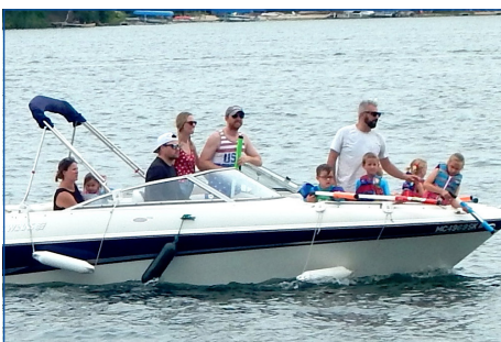
Four Winns Joining In