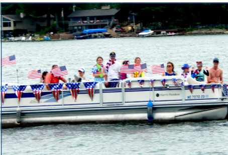
MC 7270SD Patriotic Flags Joining In