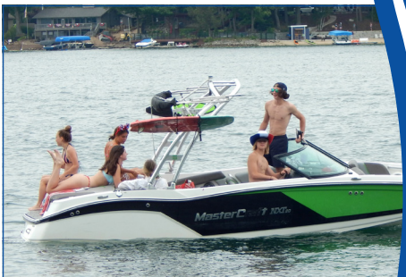
Mastercraft NXT80 Joining In