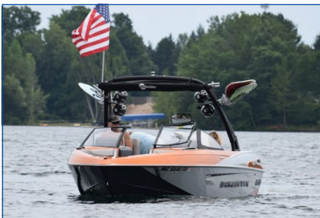
MC5542TD Patriotic Flag Joining In