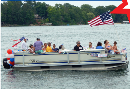
Happy 4th, SuperSport