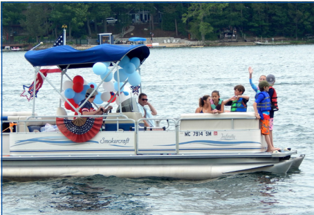
MC7914SM Patriotic Balloons