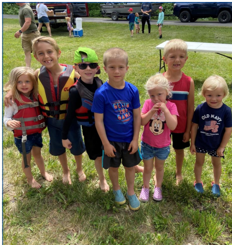
... and they all fished!