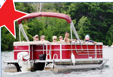
Evinrude Joining In