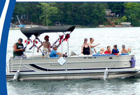
MC5432TN Patriotic Flags Joining In