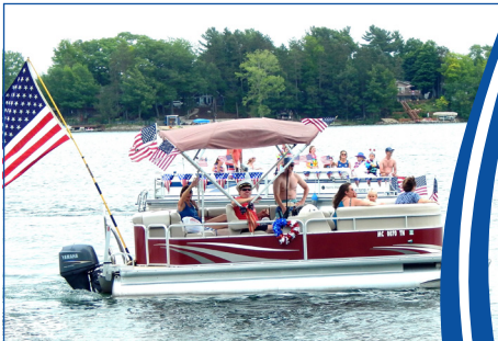
MC0070IN Patriotic Flags Joining In