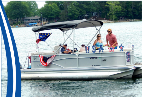
USA Patriotic MC892300