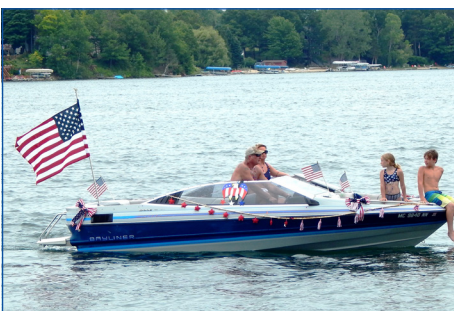
Patriotic Byliner Joining In