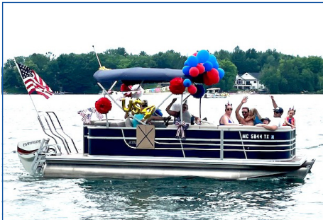
USA MC5844TI Patriotic Balloons